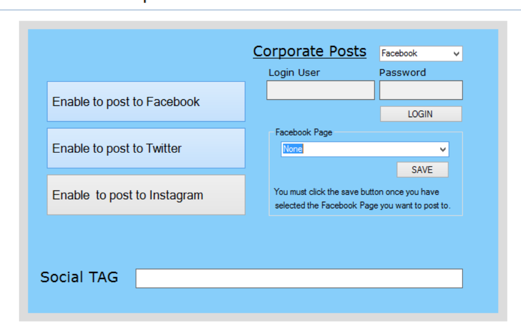
Step 10 - Social Media

Tilda incorporated a drop-down menu that allows Fotobooth to select the page where they have admin rights, as set up by the client. This approach was executed to maintain secure access and keep login information private.